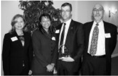
The Columbia Bank, Award of Excellence for Corporate Involvement