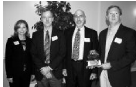
Cantwell-Cleary Company, Award of Excellence for Employment

The base of the partnership is the wonderful relationships The Arc has with the long-standing staff of the bank. The Columbia Bank is excelling in the area of corporate involvement and making Prince George's County a better place for people with developmental disabilities.